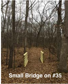
Small Bridge on #35

The PTRA is always looking out for the horse and rider. On that note, the board is planning to expand our trails to officially include those across the southern side of the Portage (Hell) Creek Bridge. You may have noticed that that bridge specifically has undergone some repairs. In a combined effort with the DNR, a cement apron has been laid as well as railings to each side. We will also be covering the bridge foundation to make it less slippery and more sound. Believe it or not, we have found that an old conveyor belt will be most useful for our needs not to mention our budget.